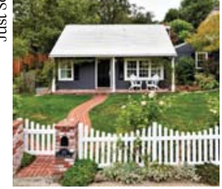
37 Stanton Avenue, Orinda Multiple Offers Over Asking Price 37StantonAvenue.com